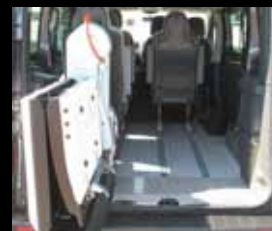
Swivel lift option available.