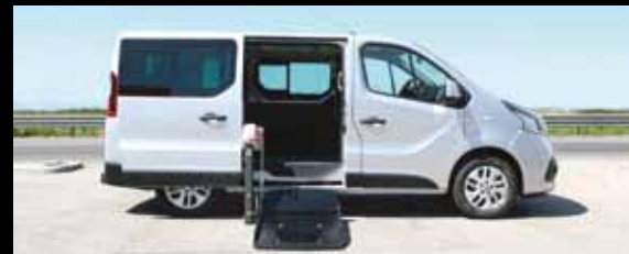
Fiorella Slim Fit installed on the side door.

Focaccia Group is certified ISO 9001:2008 and maintains constant contact to official European legislation via the Italian Ministry of Transport, ensuring the conversion is in line with EU regulations. For individual requirements and problems, a technical service is available from 8.00 to 12.30 and 14.00 to 17.30 CET via e-mail ( service@focaccia.net ) or phone +39 (0) 544 202344.